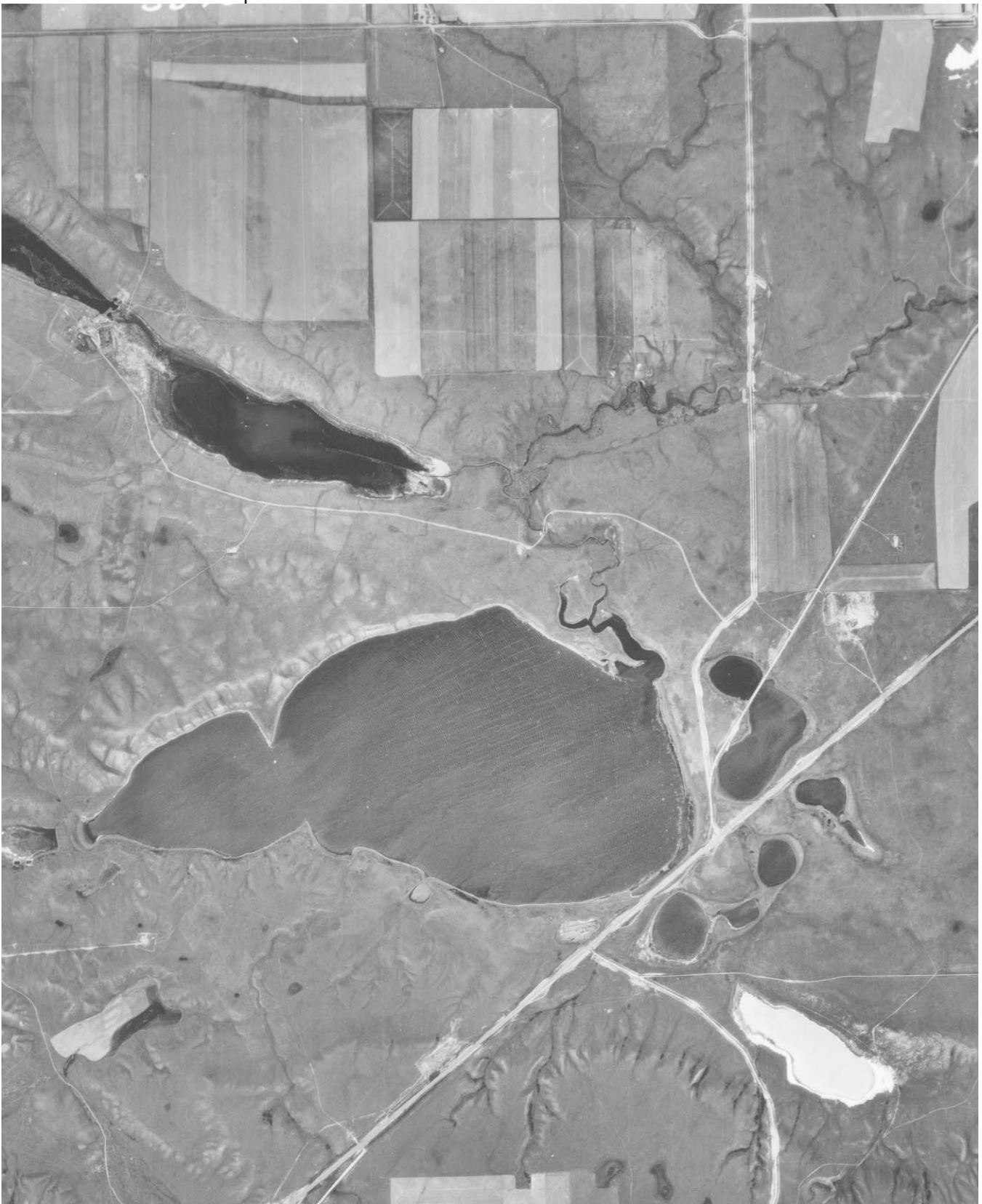
Figure 2. Airphoto of Chappice Lake in 1969

Chappice Lake Important Bird Area Conservation Plan