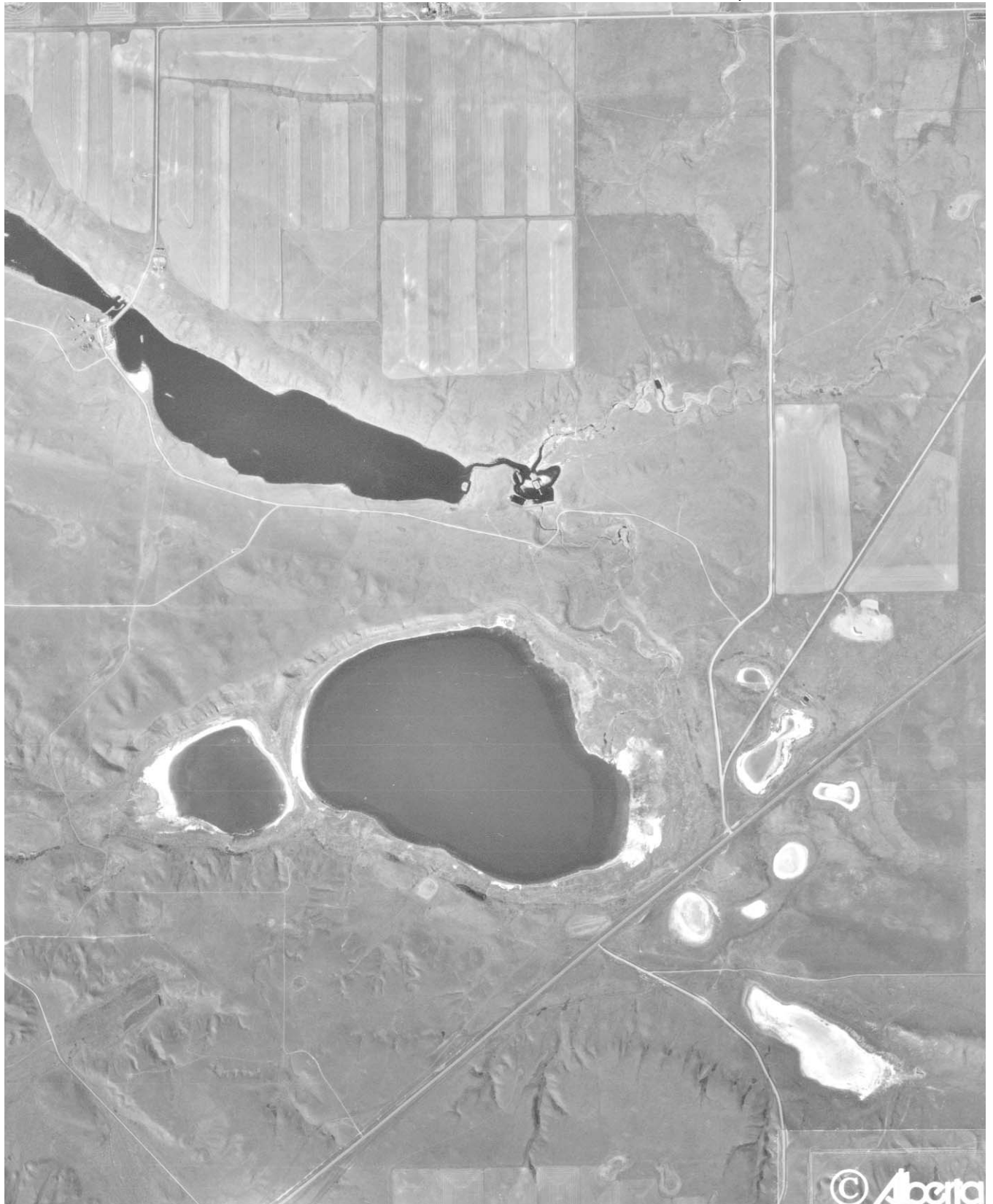
Figure 3. Airphoto of Chappice Lake in 1998

Chappice Lake Important Bird Area Conservation Plan